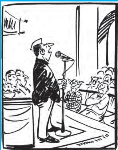
It is a malicious lie to say we topple non-Congress governments. We topple our own too like UP, Sikkim - maybe later Bihar, MP etc.

Toppling the State governments. Everyone loves to play this game!