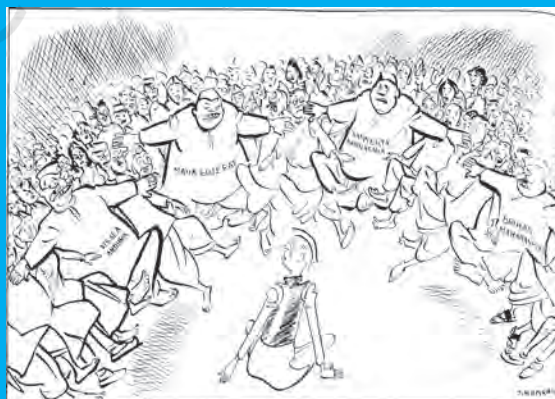
26 July 1953

Flood of demands for creating new States